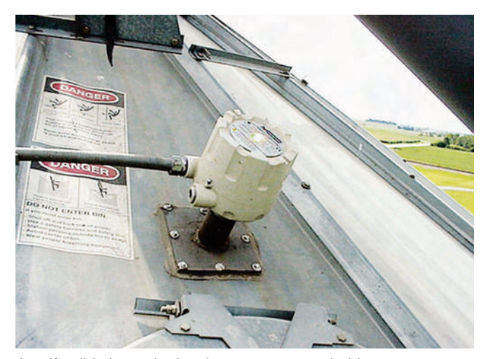
A self-validating point-level sensor on a grain bin

technology for general powderand bulk-solids point-level monitoring is the rotary paddle. The rotary-paddle operation is quite simple and reliable. The unit is installed through the wall of a vessel so that the paddle protrudes into it. A small electric motor inside the unit's enclosure drives the paddle (inside the vessel) that is connected to the output shaft of the unit. The paddle will rotate freely in the absence of mate-