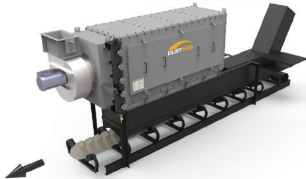
Conveyor Transfer Point Installation