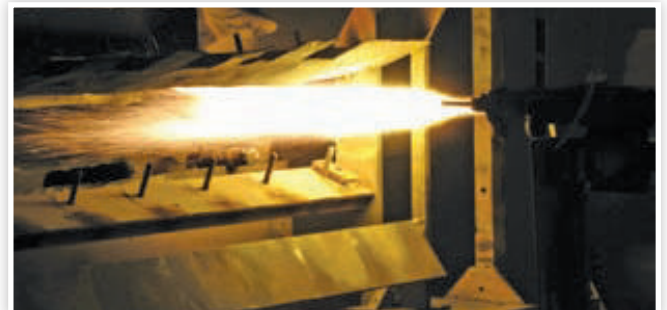
Robotic flame spray booth

"We are also very proud that in taking this step we continue to be a very green operation. Right now, and for several years, we have not had a hazardous waste stream. Everything we do in our operation is recycled."