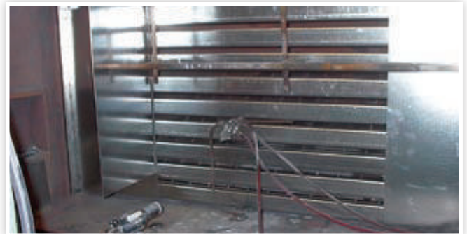
Slotted inlet source capture collection hoods provide uniform exhaust air flow.