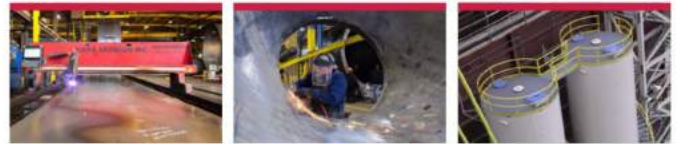
» Small Parts

CST's factory welded tanks are custom-fabricated in our state-of-the-art facility and shipped to the field as one-piece construction. When they arrive, they can be moved with a crane and immediately set into place or staged for installation at a later date.