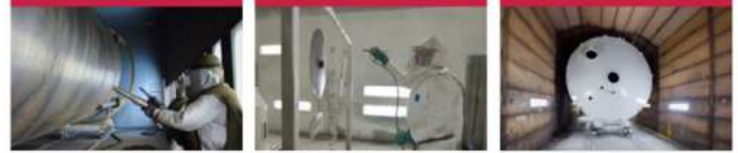
» Blast Room