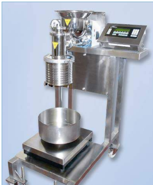
Photo 1: Coperion K-Tron volumetric feeder with integrated ILC Dover continuous liner

Dispensing is often a step in a variety of processes including centrifuge and filter dryer discharge, batching directly into IBC's (Intermediate Bulk Containers), hoppers or drums, and batch ingredient dispensing directly into batch blenders and reactors. In the pharmaceutical industry the batched ingredients often include potent compounds, resulting in the need for a batching device that can be easily contained to eliminate any exposure of the product to the operator or to the environment.