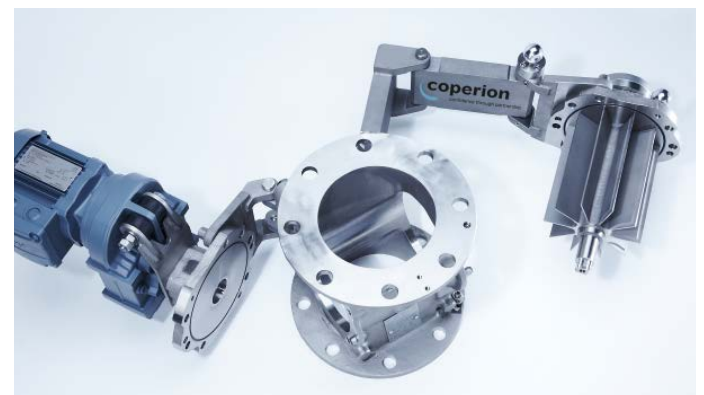
Coperion ZRD rotary valve with FXS extraction device