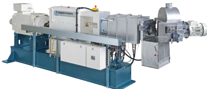
The Coperion ZSK MEGA volume PLUS is especially suitable for the economical processing of dry and semi-dry dog and cat food and treats.

After all ingredients have been fed into the extruder, they must be mixed homogeneously. Usually this can be done by one or more mixing zones, which consist of combinations of different