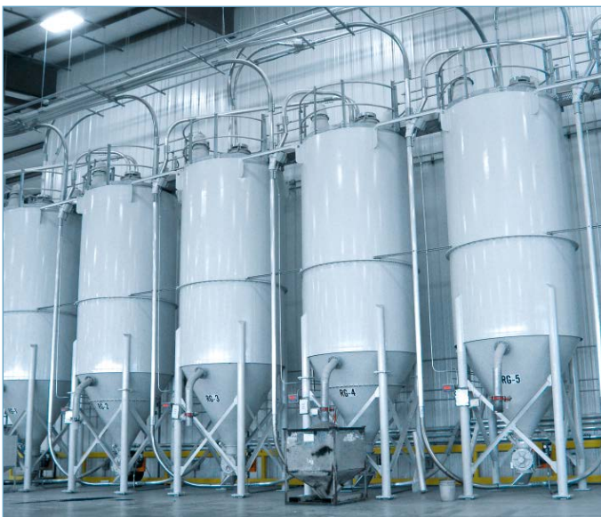
Coperion K-Tron pneumatic conveying system

In-line or off-line screeners are often used during the raw ingredient transfer process for