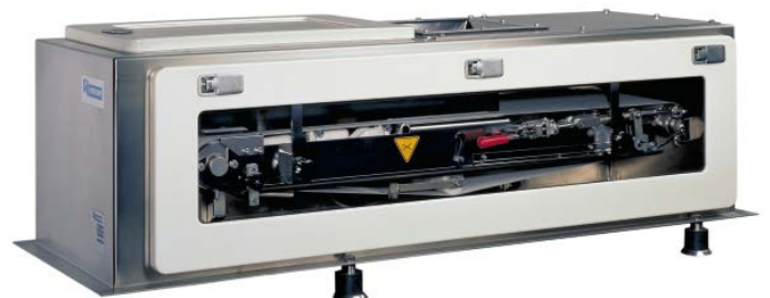
Coperion K-Tron Smart Weigh Belt (SWB) feeders are available in closed frame (shown) or open frame models.